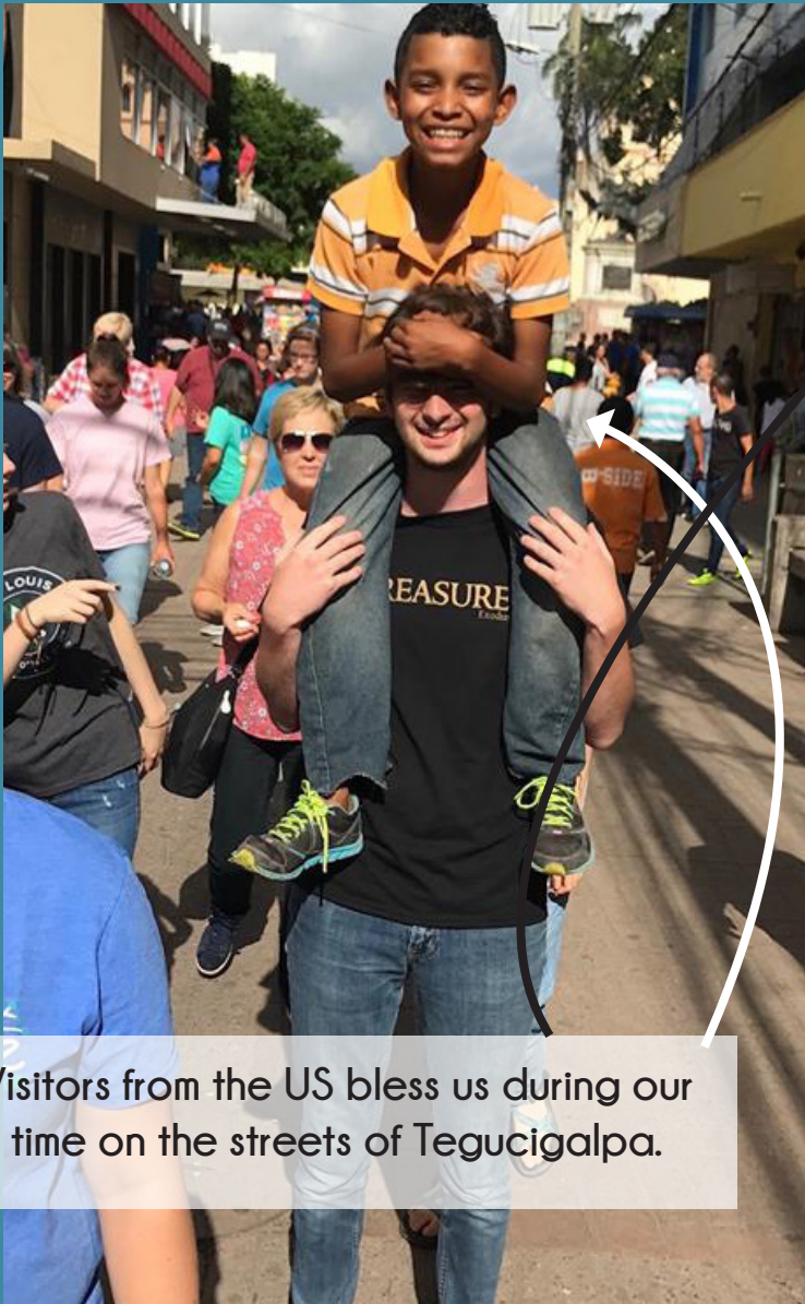
Visitors from the US bless us during our time on the streets of Tegucigalpa.