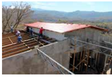
A great view of our new roof from the second floor terrace of the new Micah House!

Speaking of full steam ahead, the new Micah House at Micah 2.0 took some huge steps forward in March! It was so exciting to see the first roofing tiles go on to the house; you could really start to see what the house was going to look like once finished! The building process is in good shape in order to finish the house before our August 17th inauguration!