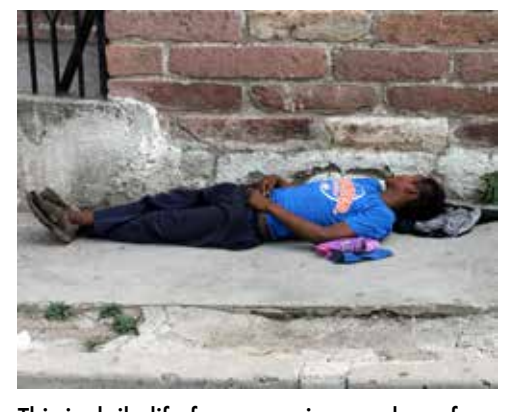
This is daily life for a growing number of kids and teens in Tegucigalpa.